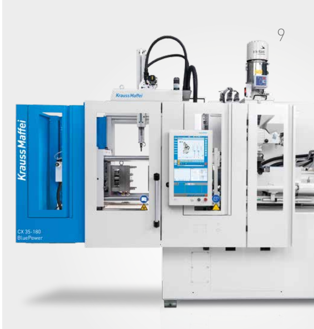
Production cell geared up for ideal efficiency.