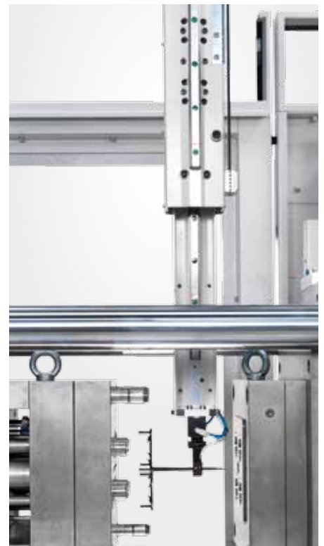
Vibration-free demolding makes for faster cycle times