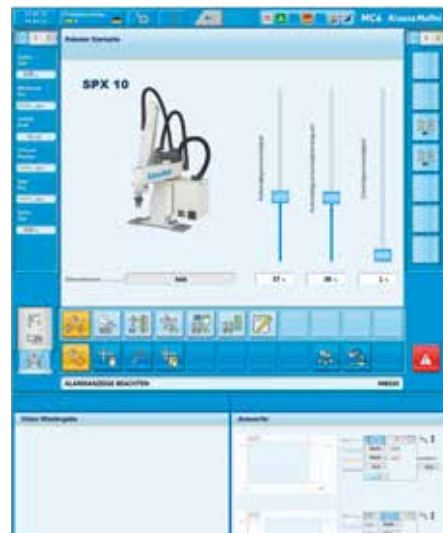
With WizardX, programming the SPX10 could not be easier.