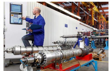
Test center after assembling